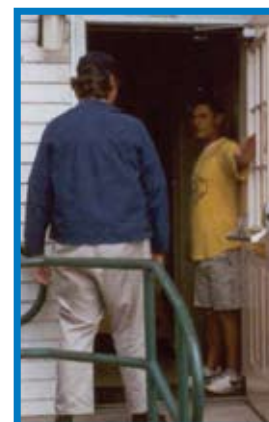
St. Patrick Haven and St. James Haven provide shelter and fellowship for homeless men.