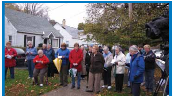
Sisters, families and friends at one of 12 vigils held this year.

Recently, eleven 1 first and second grade students from the SSJ Neighborhood Network participated in the Ophelia Project ( www.opheliaproject.org ) and were taught about self-esteem, teamwork, attitude and respect (STARS). They also discussed how to handle bullying in school and during after school hours. In addition, many mothers have attended a program at the SSJ Neighborhood Network called Time Out for Moms which includes presentations on developing healthy relationships. These may appear to be insignificant undertakings toward resolving the violence that the UN labels a ‘universal challenge,’ however, it is through such community programs that the seeds of nonviolent living will be planted and perhaps eliminate the need for Take Back the Site vigils in our community.